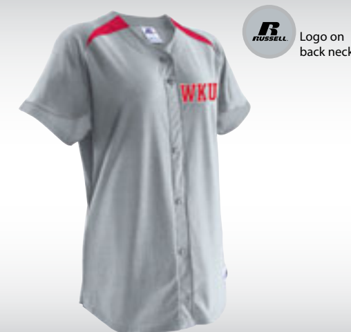
R RUSSELL Logo on back neck