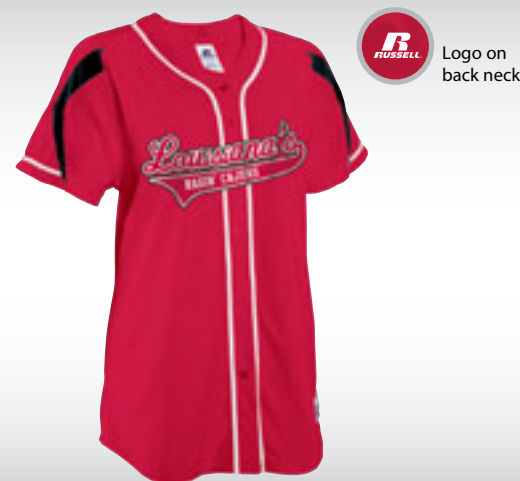
R RUSSELL Logo on back neck