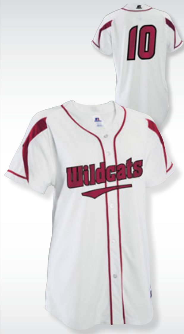
Decoration as shown: $164.10 see page 79 for Construction & Decoration as pictured