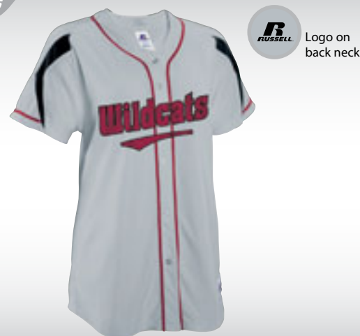
R RUSSELL Logo on back neck