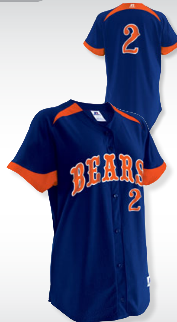
Decoration as shown: $150.40 see page 79 for Construction & Decoration as pictured