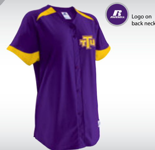
R RUSSELL Logo on back neck