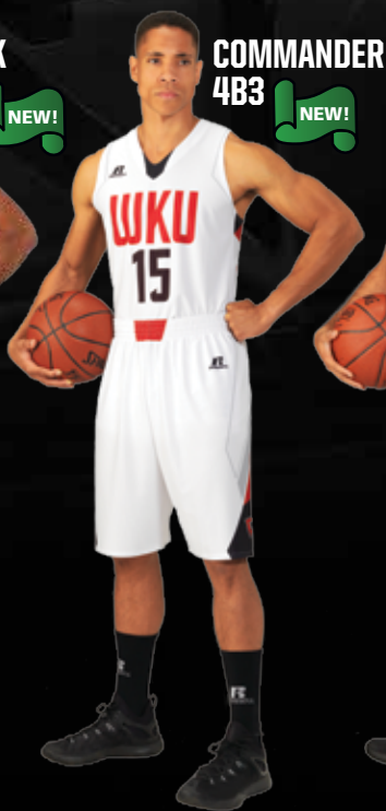
COMMANDER 4B3 NEW!