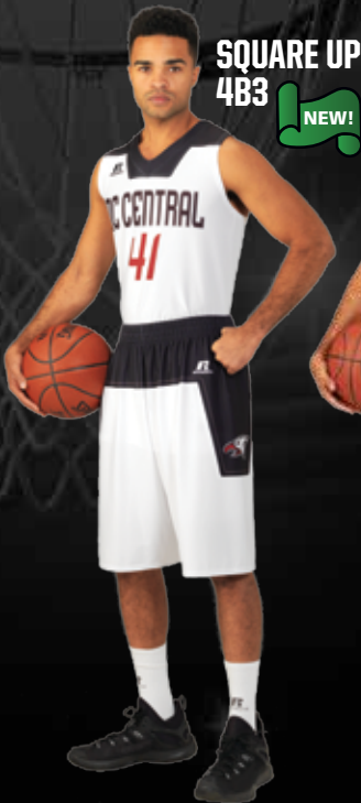
SQUARE UP 4B3 NEW!