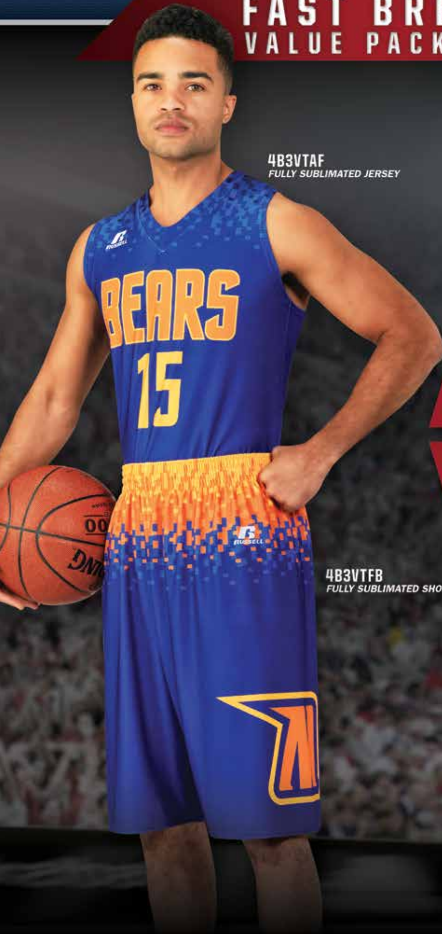
4B3VTAF FULLY SUBLIMATED JERSEY