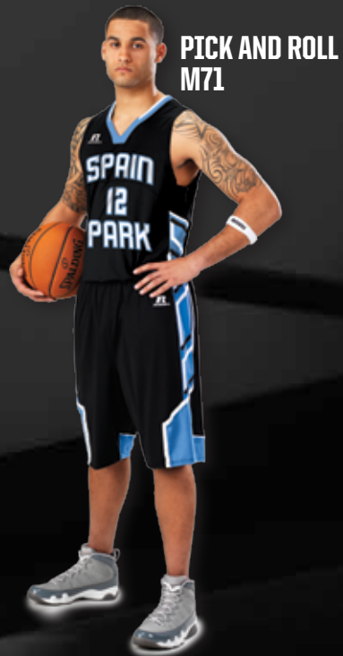
PICK AND ROLL M71