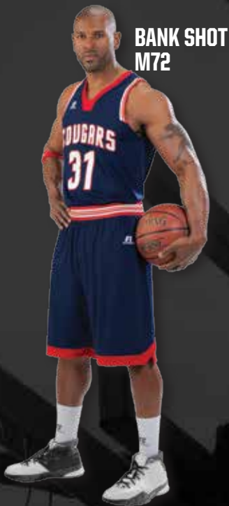
BANK SHOT M72