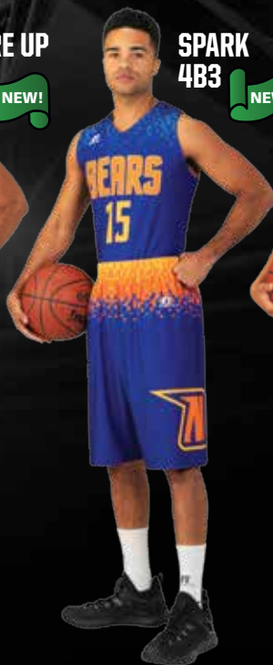
SPARK 4B3 NEW!