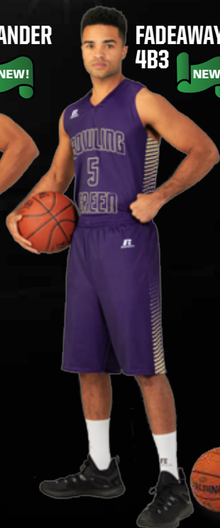
FADEAWAY 4B3 NEW!