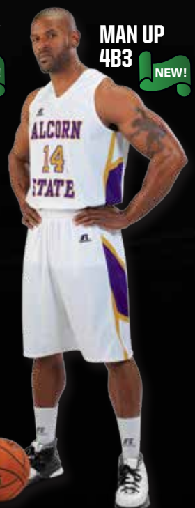
MAN UP 4B3 NEW!

SPECIAL PACKAGED PRICING OFFERED BY RUSSELL TEAM SPECIALIST RTS DEALERS ONLY.