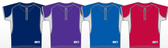
N9B Navy/Baseball Grey P9B Purple/Baseball Grey R9B Royal/Baseball Grey T9B True Red/Baseball Grey