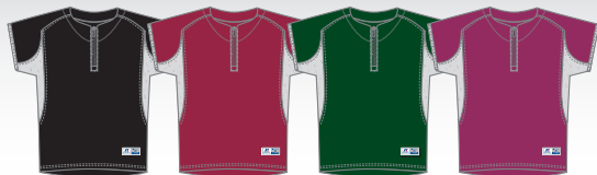
B9A Black/Baseball Grey C9A Cardinal/Baseball Grey D9B Dark Green/Baseball Grey M9B Maroon/Baseball Grey