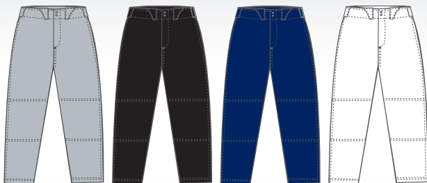
BG7 Baseball Grey