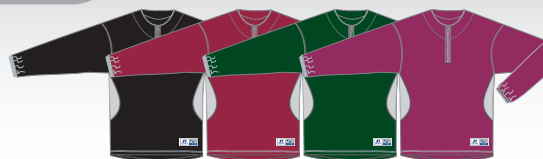
B9A Black/Baseball Grey C9A Cardinal/Baseball Grey D9B Dark Green/Baseball Grey M9B Maroon/Baseball Grey