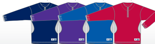
N9B Navy/Baseball Grey P9B Purple/Baseball Grey R9B Royal/Baseball Grey T9B True Red/Baseball Grey