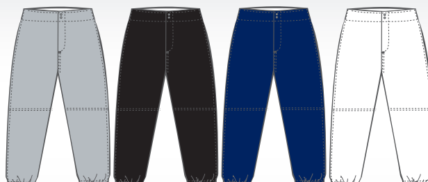
BG7 Baseball Grey