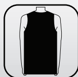
FULL ATHLETIC CUT