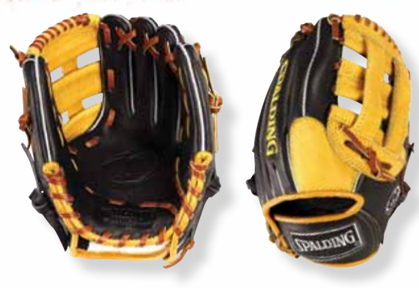
ITEM# 42-090 PATTERN Infield SIZE 11" REG WEB H-Web BACK Open COLOR Black/Tan