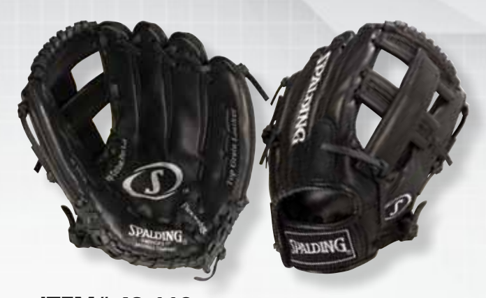
ITEM# 42-110 PATTERN| Youth SIZE| 10" REG WEB| Single Bar BACK| Open COLOR| Black/Silver